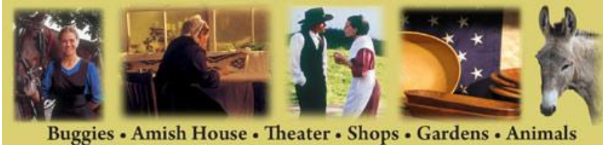
Buggies • Amish House • Theater • Shops • Gardens • Animals